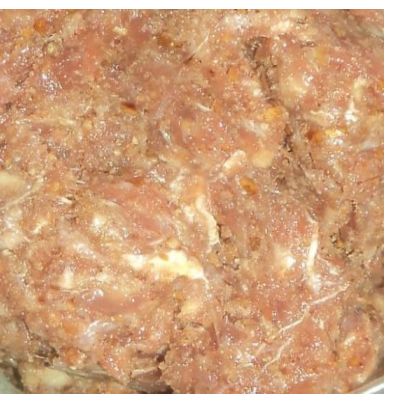
Plate 3 Beef Burger with 10%TNF