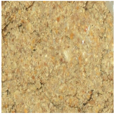
Plate 5 Beef Burger with 20%TNF IJSER© 2021 http://www.ijser.org