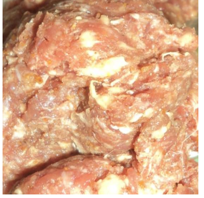
Plate 2 Beef Burger with 5%TNF