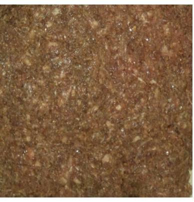
Plate 4 Beef Burger with 15%TNF