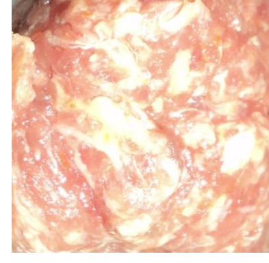
Plate 1 Beef Burger with 0%TNF (Control)